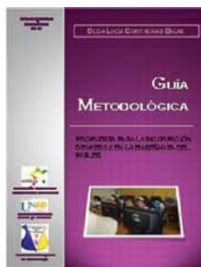
Figure 2. Front cover of the product